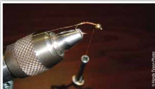
Hook wrapped with brown thread and gold wire tied in at bend