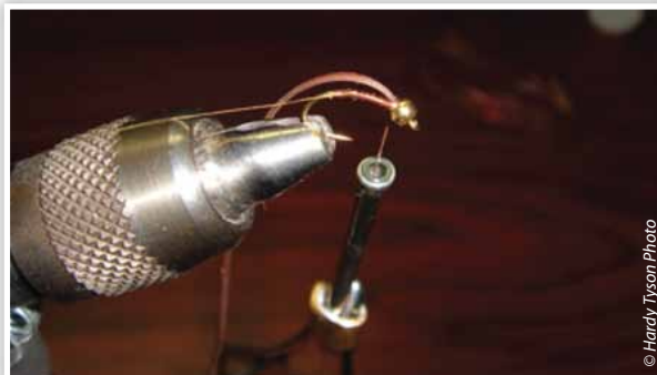
Sili leg tied in at the eye