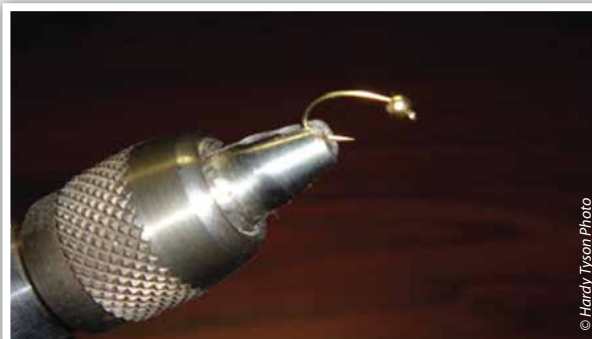
TMC 2487 size 14 hook with 3/32” bead