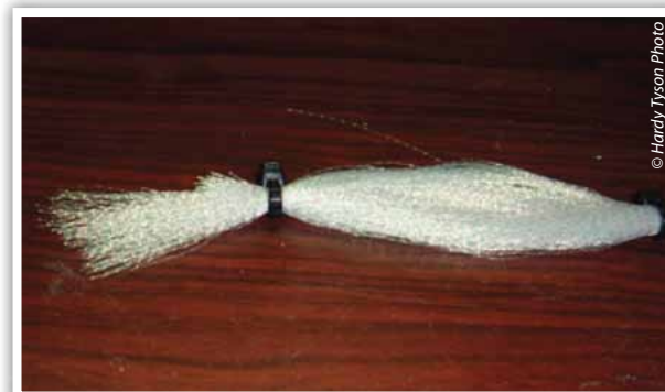
Bundled crystal flash ready to be cut and stacked

I have incorporated Jack Dennis' invention of tying crystal flash as an under wing to all my hair down-wing style flies. This feature gives the impression of motion from the fishes perspective as the fly floats through the feeding lies. I had trouble with the crystal flash tangling and not being able to cut constant length pieces to stack in the hair stacker. I solved the problem by bundling the crystal flash and tying zip ties around the bundle. Now the crystal flash is manageable!