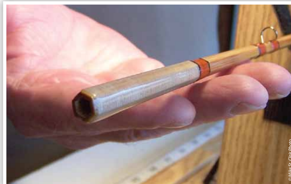
"The finished beauty of a St. Clair bamboo fly-rod"