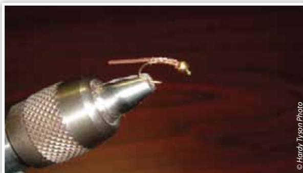
Sili leg lashed to the hook with the gold wire and whip finished