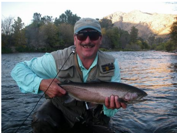
Miracle fish, miracle summer!!

A few years later, I decided I wanted to pay back to the sport I had come to love so much. I wasn't sure what to do, I finally decided to teach a Fly Fishing Mentoring Class. I would take a few unfortunate souls that would volunteer to spend the day fishing with me and try my best to teach them pretty much all I knew about fishing. That took about fifteen minutes. The rest of the time I acted like I knew what I was doing, showing holding water, sneaking up on the little fishes, that kind of thing. Those classes for some reason went over really well. Many of my students caught either their first fish on a fly rod or their personal best on those outings. I was blessed more than my students. I met some really wonderful people, most of which still will talk to me. Truly, I have met life changing people teaching those classes, doing that is something I would never change and hope never changes on it's own. I certainly plan to spend more days Mentoring.