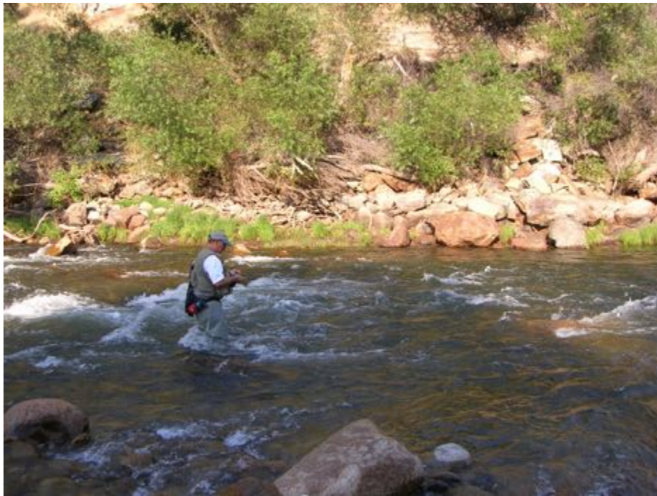
Just getting this figured out!!

I fished the Kern River exclusively for the first few years. With good reason, those were magical years. The winters were long and full of snow. The summers were nice and the cold water was incredibly addictive. I remember fishing places on the Kern that have changed, not how I would like them to, but those easily will change back, maybe sooner than we think.