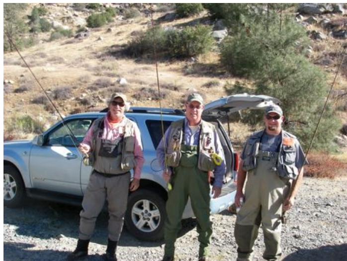
Three great fly fishers, one life changing friend!!

Adding awesome people to your world is always a good change!